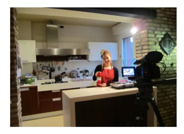
Making audio-visual materials in Italy for the Italian materials

LanCook has a dissemination strategy which is designed to allow as many people as possible to engage with the project work as direct and indirect beneficiaries and contribute to the sustainability of the project results. The partnership aims to achieve this by: